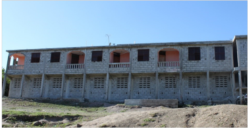
Grace School of Île-a-Vache