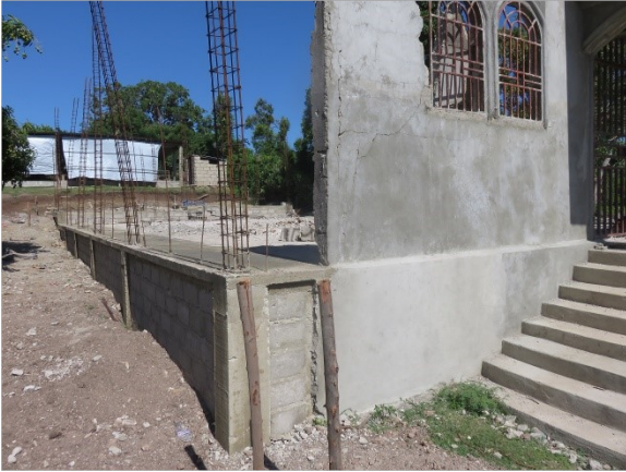
Ecole Sainte Trinite of Île-a-Vache